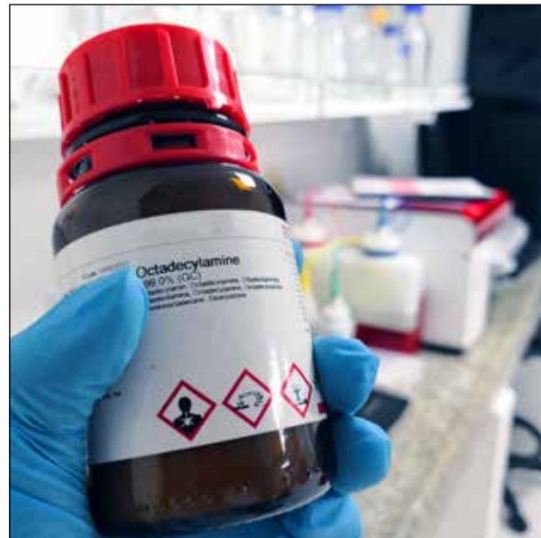
2-color labeling for hazardous warnings