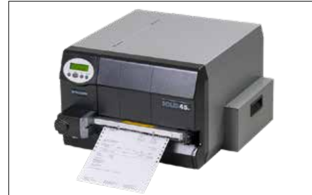
SOLID 45ET - Continuous Thermal Printer