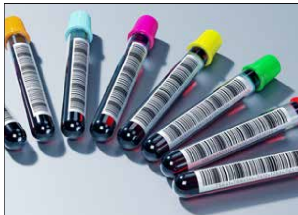
High quality labeling