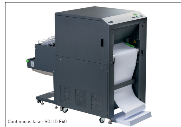
Continuous laser SOLID F40