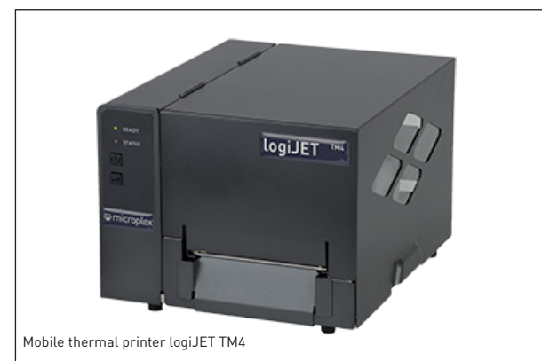
Mobile thermal printer logiJET TM4