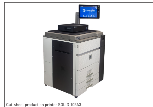
Cut-sheet production printer SOLID 105A3

Examples of Microplex products for replacement in SAP printing environments.