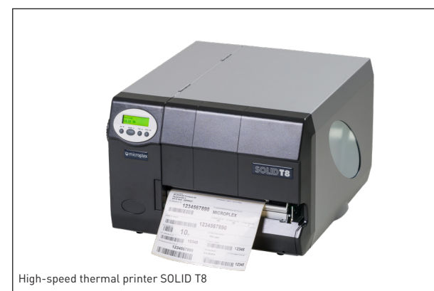
High-speed thermal printer SOLID T8