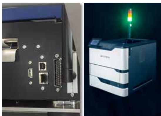
Connectors logiJET TM8