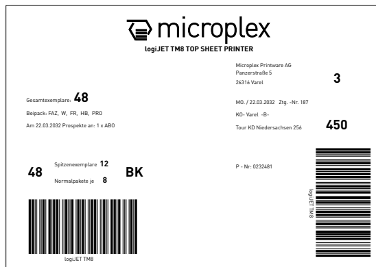
Typical top-sheet für newspaper stacks in A4 format