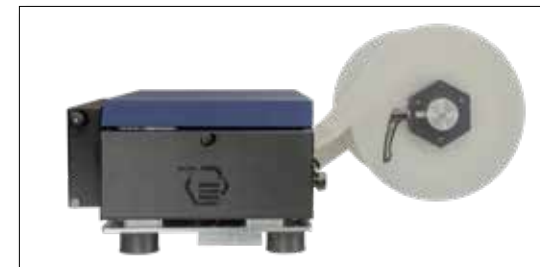
logiJET TM8 - Paper feeding from roll

Microplex thermal printing systems can process and print paper rolls as well as z-folded paper from the stack (cardboard). Loading the printing material is quick and easy.