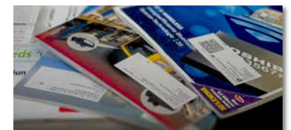
Magazines with Cheshire labels