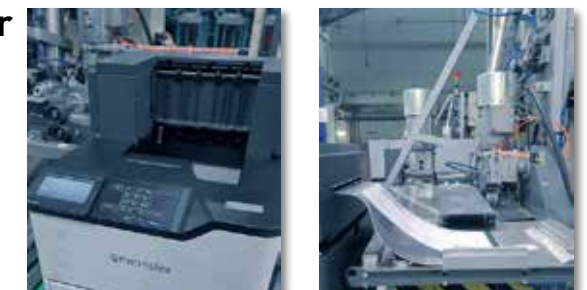
SOLID 52A4 in the newspaper mailroom