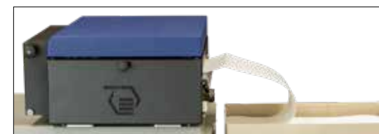
logiJET TM8 - Paper feeding z-folded

The paper feed via a stack or a roll ensures trouble-free paper transport into the printer. The top-sheets are separated after printing using an optional cutter . From here, the resulting single sheets can be taken over by the processing plant and transported on. You can use the external paper feed to flexibly adapt the paper supply to your requirements, so that, for example, you can produce a shift without changing paper. Here using the example of the logiJET TM8 .