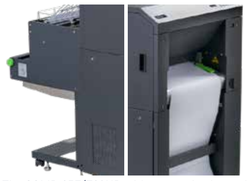
The SOLID 85E/F90HD with tractor feeder and high capacity stacker