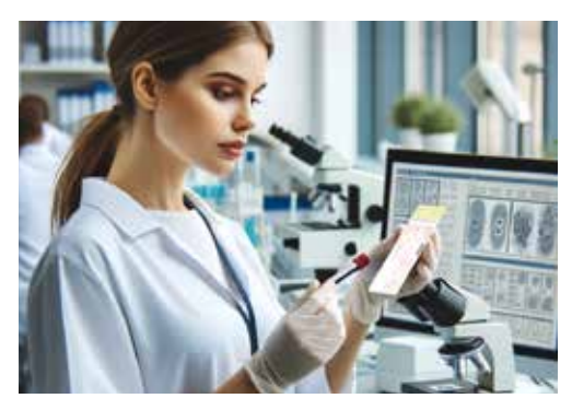
Examining the blood sample in medical lab