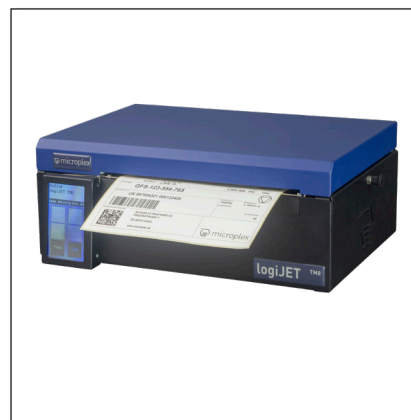
Mobile thermal printer - i.e. logiJET TM8