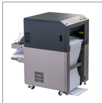
Continuous forms printer - i.e. SOLID F40