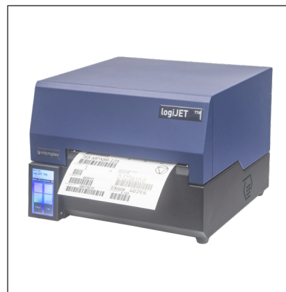
Thermal printer - i.e. logiJET TT8