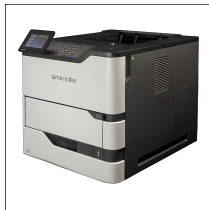
Cut sheet printer - i.e. SOLID 52A4