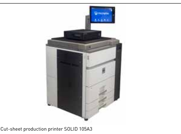
Examples of Microplex products for replacement in SAP printing environments.