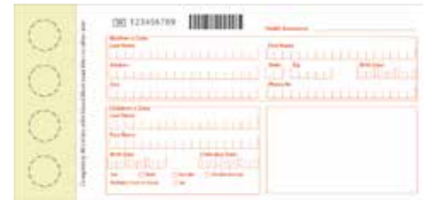
Heel prick test card

The SOLID 85E/F90HD prints newborn screening cards fast and efficient.