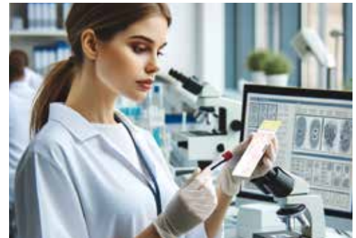
Examining the blood sample in medical lab