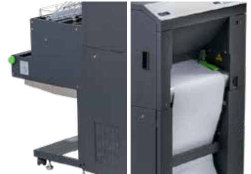
The SOLID 85E/F90HD with tractor feeder and high capacity stacker