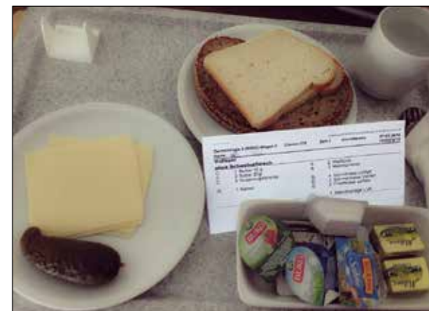
Meal Guide Cards