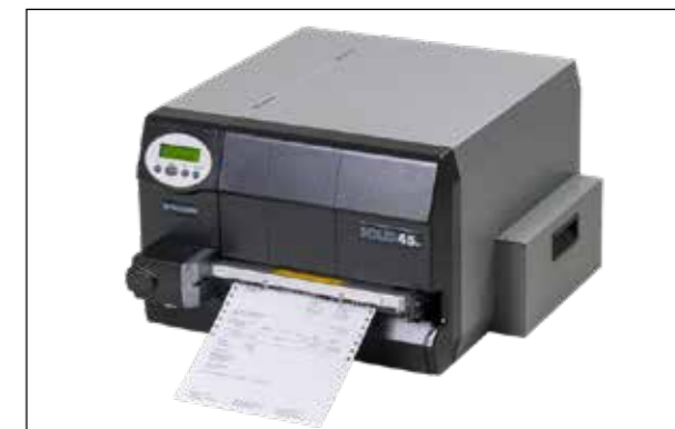
SOLID 45ET - Continuous Thermal Printer