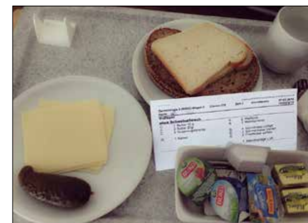
Meal Guide Cards