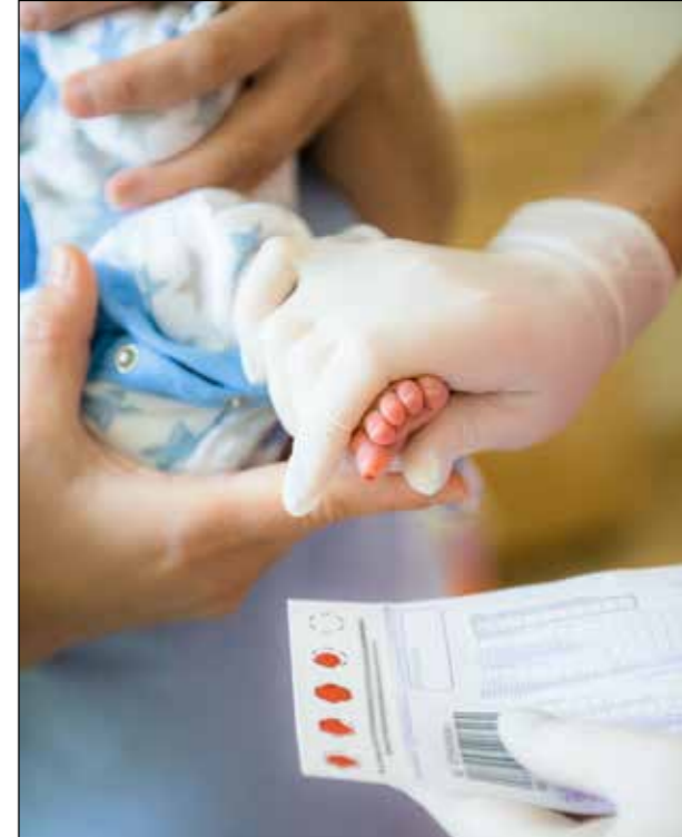
Heel Prick Specimen Cards