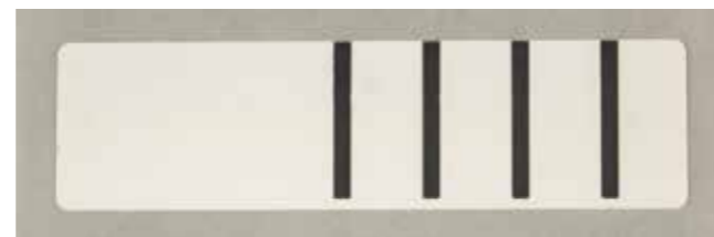
An unreadable RFID label voided for application security